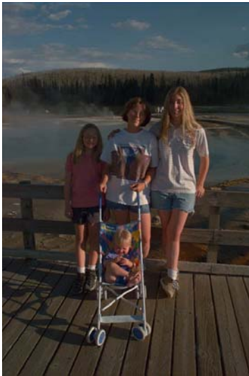
Scene referred image

set/gamma/luminance and ambient condition). Of course if the display is profiled and the data being previewed has an embedded profile, the sRGB file or any tagged file for that matter, will preview correctly in an application like Photoshop. Nonetheless, what is being seen, and ultimately output, isn't a colorimetric representation of the actual scene (scene-referred). This is one reason why producing "accurate" color from a digital camera can be difficult. Accurate is in quotes since nearly every user has a different definition of what they mean or want when they say accurate. It should be noted that this rendering and encoding process isn't necessarily limited to the process of creating images using digital cameras.