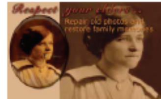
Photo Restoration Canvas Printing Slide Scanning Image Rescue

Passport Photos While You Wait! No appointment necessary